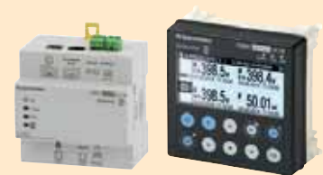
DIRIS Digiware M-70 & D-70